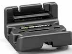
NXT MAX WALL 10 G wall fastener for NXT lung ventilators EV50122B