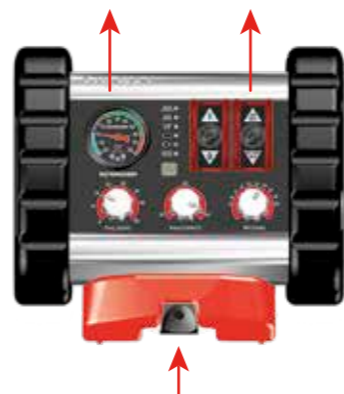
Quick release button