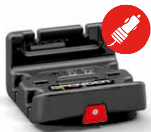
NXT MAX P 10 G fastener/charger for NXT lung ventilators EV50121B EV50120B (without charger)

Easy to install inside the emergency vehicle.