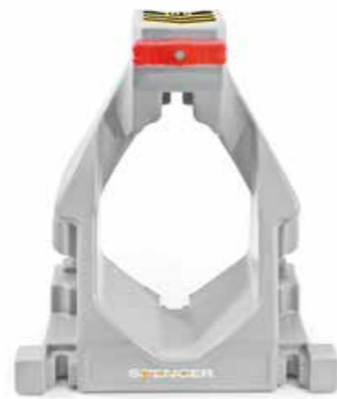
4BELL MAX 10G fastener for chair 4BELL. ST10432B