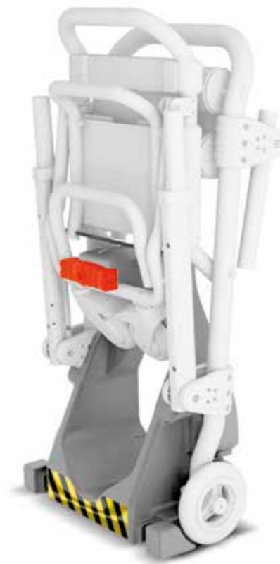
WALL BRACKET Wall fastener for SKID OK and SKID OK B evacuation chairs. SK14001B