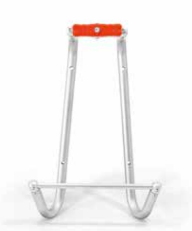
4BELL STAIR MAX 10G fastener for 4BELL STAIR chair. ST10441B

Spencer offers a complete range of fasteners for evacuation and transport chairs. Each model is specifically engineered to provide the most secure support to the chair inside an emergency vehicle. The combination of each transport and evacuation chair with its own specific fixing device creates a system able to offer maximum compactness for storage, intuitive use and ideal safety.