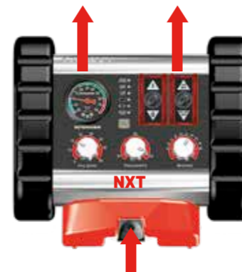
Quick release button

Innovation starts with understanding what our customers need and, as a global leader in EMS technologies, Spencer is anticipating all the challenges of a changing industry. Thanks to our latest innovation, we create a new layout for fasteners which are fully interchangeable between Ambujet S and all NXT ventilators made by Spencer.