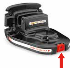
Quick release button

Downtime is the enemy of productivity. That is why AMBUJET is engineered to be easy and fast to install, while minimizing the need for routine maintenance. Thanks to the perfect integration between the fastener and the suction unit, the overall dimensions remain almost identical to those of the suction unit itself.