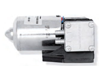
MOTOR DRIVEN VACUUM PUMP

Please contact our local representative for more Information about oxygen delivery system. Spencer also offer instillation & technical support for oxygen delivery system to ambulance builders.