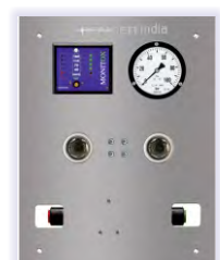
ODS PANEL WITH CHANGEOVER

Please contact our local representative for more Information about oxygen delivery system. Spencer also offer instillation & technical support for oxygen delivery system to ambulance builders.